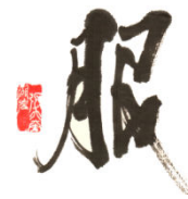
Calligraphy for Do-Bok. Figure 3