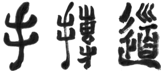
Seal Script for Soo Bahk Do (left to right). Figure 1

The term “Bahk” has many meanings including to tangle, twist, turn over, pound, or change. An example would be a farmer turning over the soil which is a form of